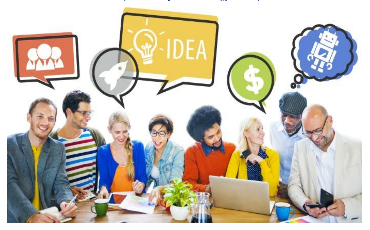
Useful tips to boost your technology Start up idea

Investors are always on the hunt for people who are able to execute plans. They like people who know what it takes to get things going in the right direction. So for you to taste success, the right ingredients will be an original and discussed strategy with a team that has the power to execute it to perfection.